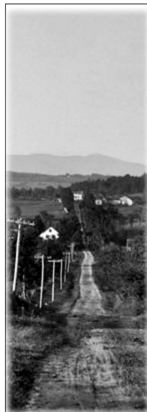
This image of South Pleasant Street is included in Then & Now: Main Street — a special exhibit through October 11.